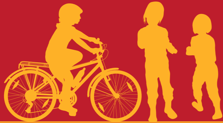
Calories burned per minute by children doing different activities 7