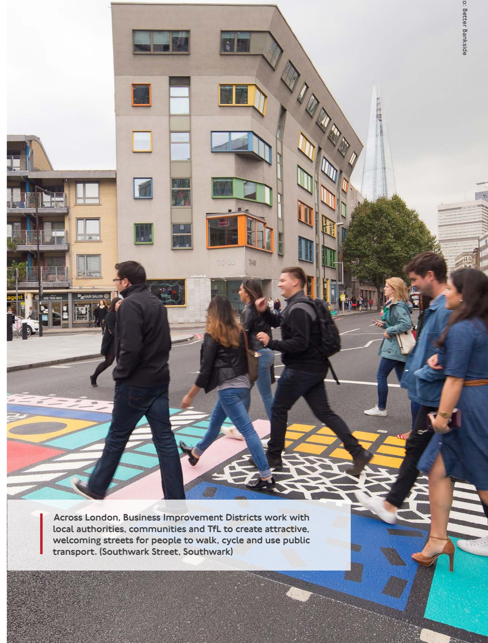
Across London, Business Improvement Districts work with local authorities, communities and TfL to create attractive, welcoming streets for people to walk, cycle and use public transport. (Southwark Street, Southwark)

The London Plan will be published in draft in 2017.