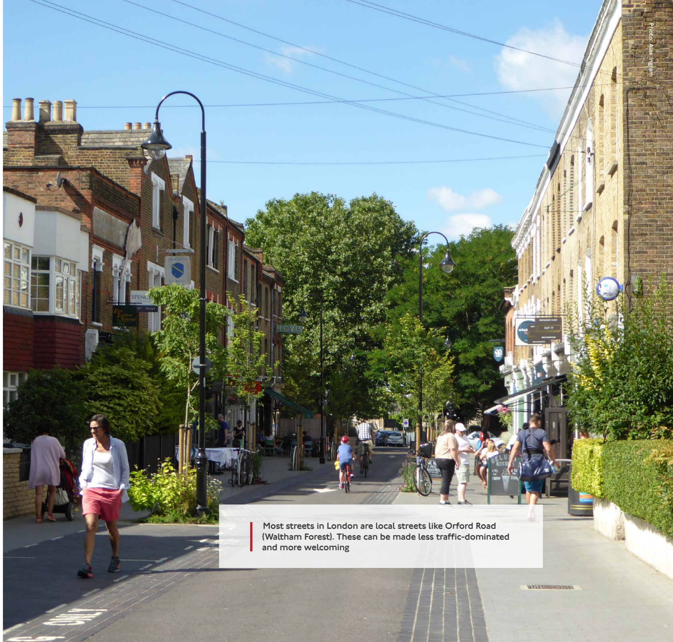
Most streets in London are local streets like Orford Road (Waltham Forest). These can be made less traffic-dominated and more welcoming

The Mayor's forthcoming Transport Strategy will describe the measures we will take to achieve this. In part, this will involve allocating more road space to the most efficient travel choices – installing new cycle lanes, giving buses more priority and providing more space for pedestrians. Over time, reallocating space will create streets that function better not only for people who are walking, cycling and using public transport, but also for taxis and essential delivery, servicing and car journeys. These changes have the potential to make short-term congestion worse in some locations. The Mayor has committed to planning and coordinating street improvement works more effectively to reduce this impact, and has announced a package of short-term measures that will keep the streets running as smoothly as possible. The Mayor's Transport Strategy will also look at how we can incentivise reductions in the most harmful car use more directly.